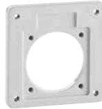
ADAPTER PANEL for Power Cube