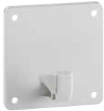
COVER PANEL WITH HOOK for Power Cube

Housing size: W x H x D 104 x 104 x 193 mm (incl. hanger, without attachments) Screwed cable inlet for cables 3 x 1,5 to 5 x 6 mm 2 max. 19 mm diameter Cubes are fitted with strain relief and 5 x 6 mm 2 clamping block