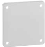
COVER PANEL for Power Cube