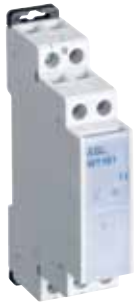
MOMENTARY-CONTACT SWITCH 16 A 250 V~

Button, light signals and SCHUKO socket outlet