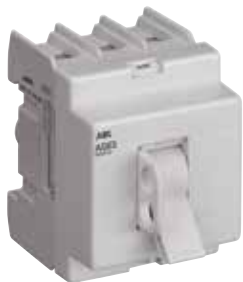
ON/OFF SWITCH 3-POLE 415 V~

Incoming circuit breaker for circuit distribution board, lockable in the "ON" or "OFF" position, maximum connection cross section 25 mm 2