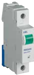
LIGHT SIGNAL 230 V UC