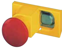
EMERGENCY-STOP BUTTON latching, turn to release red, on yellow surface