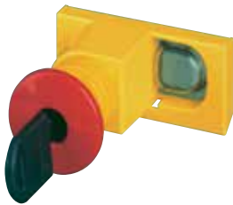
EMERGENCY-STOP BUTTON latching, key release (2 keys) red, on yellow surface