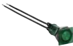
INDICATOR LIGHT with glow bulb, nominal rated voltage: 220-240 V