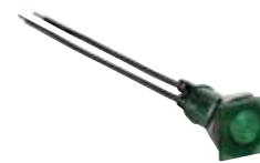
INDICATOR LIGHT with glow bulb, nominal rated voltage: 380-440 V