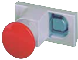
STOP BUTTON not latching red, on grey surface