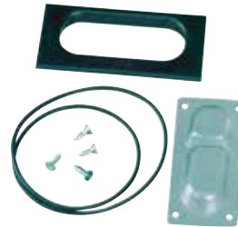
KIT IP55 to increase degree of protection from IP41 to IP55